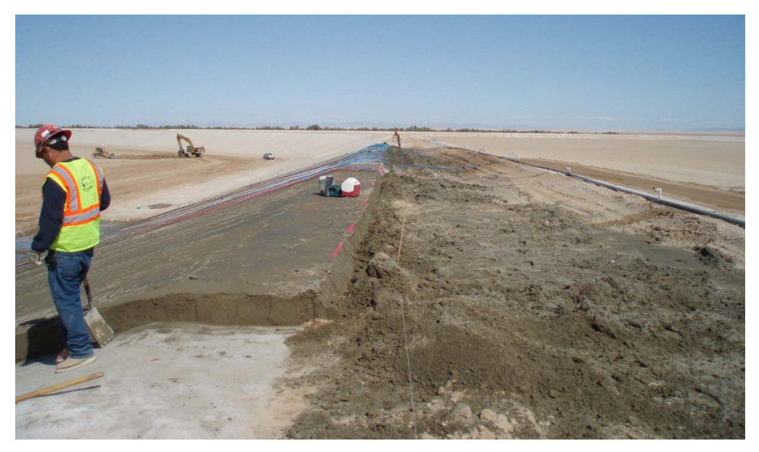
Figure 17.5.5-2. Plating soil-cement placement at Warren H. Brock Reservoir, California. (Note the vertical construction joint.)

Lifts placed parallel to the slope (plating) have been constructed in single and multiple lifts at past Reclamation construction projects. Lift thickness has ranged from 6 to 12 inches. Soil-cement slope protection will typically require plating thicknesses of 9 to 12 inches minimum. A single 9-inch lift of soil-cement (as shown on figure 17.5.5-2) was placed on the geomembrane on the 3H:1V embankment slopes at Warren H. Brock Reservoir in California.