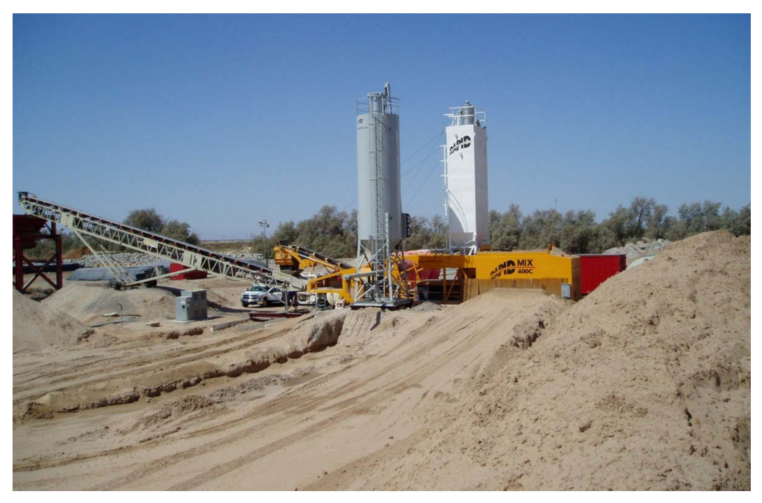
Figure 17.6.2-1. Pugmill used to make soil-cement at Warren H. Brock Reservoir, California.

Water content limits at the time of compaction have been previously specified to be between 1 percentage point wet and 1 percentage point dry of optimum. Most Reclamation jobs constructed to date have used a water content at or drier than optimum. When the mix is too wet, trafficability and compaction difficulties can