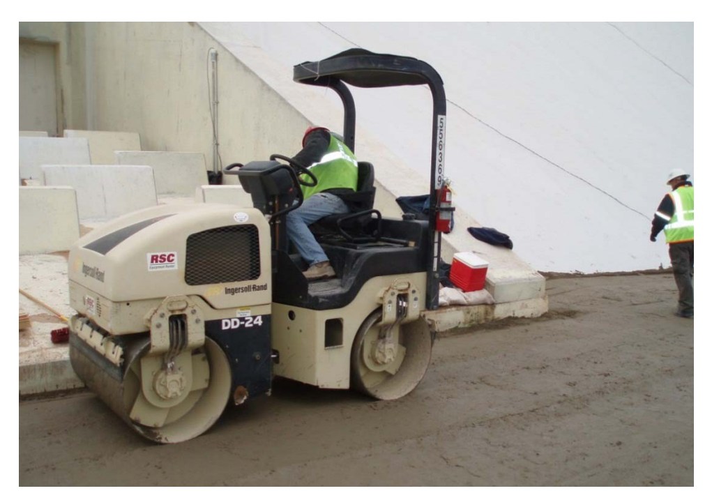
Figure 17.6.3-3. Vibratory steel drum roller used to compact soil-cement at Warren H. Brock Reservoir, California.