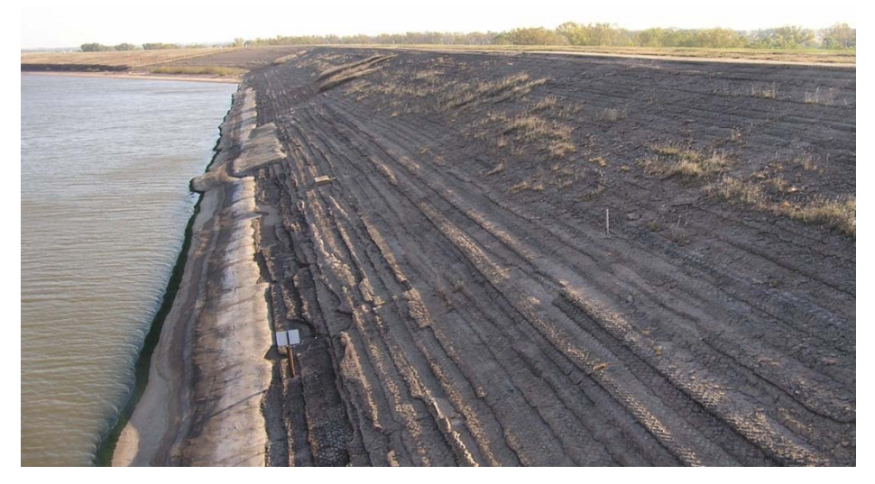
Figure 17.2.2-3. Upstream slope showing soil-cement slope protection and concrete repairs at Cheney Dam, Kansas.

As shown in figures 17.2.2-3 and 17.2.2-4, repairs consisted of placing concrete over the deteriorated soil-cement slope protection. Figure 17.2.2-3 shows the concrete patch above the normal reservoir water surface on the upstream slope of Cheney Dam, looking toward the left abutment. Figure 17.2.2-4 is a closeup view of the concrete patch on the upstream slope, looking toward the right abutment. These photographs were taken during the 2007 Comprehensive Facility Review (CFR) examination.