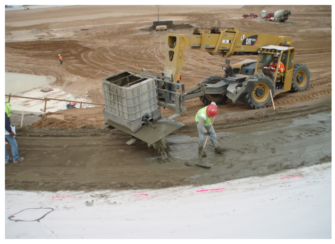
Figure 17.5.7-1. Spreading of cement slurry bonding agent at Warren H. Brock Reservoir, California.

Also discussed previously, increasing bond strength seems to have good potential for minimizing slab breakage. Brooming alone does not appear to be effective in increasing bond strength. Providing a cement slurry or cement paste bonding treatment is recommended between all soil-cement lifts. Dry cement powder has also been successfully used as a bonding treatment. The dry cement is placed uniformly across the width of the soil-cement lift at an application rate of about 1 pound per square yard. The cement should be applied to the moistened surface immediately prior to placement of the next lift. One problem with using dry cement paste treatments are recommended over the use of dry cement powder. Cement slurry having a water-cement ratio of 0.70 was used at Warren H. Brock Reservoir to provide the bonding agent between soil-cement lifts. The slurry was mixed in a batch plant and transported to the site. Figure 17.5.7-1 shows the placement of the slurry at Warren H. Brock Reservoir.