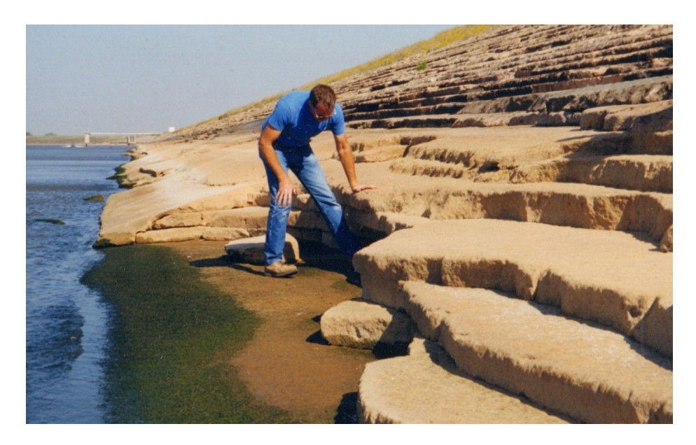
Figure 17.2.2-2. Damaged soil-cement slope protection on the upstream slope at Cheney Dam, Kansas.

As shown in figures 17.2.2-3 and 17.2.2-4, repairs consisted of placing concrete over the deteriorated soil-cement slope protection. Figure 17.2.2-3 shows the concrete patch above the normal reservoir water surface on the upstream slope of Cheney Dam, looking toward the left abutment. Figure 17.2.2-4 is a closeup view of the concrete patch on the upstream slope, looking toward the right abutment. These photographs were taken during the 2007 Comprehensive Facility Review (CFR) examination.