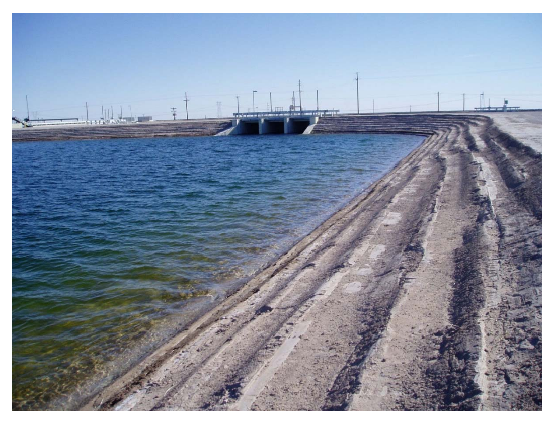
Figure 17.5.3-2. Stairstep soil-cement at Warren H. Brock Reservoir, California.

The plating method of placement is defined as slope protection consisting of one or more lifts of soil-cement placed parallel to the slope. The plating method of placement can be considered for use on small dams where wave action is not severe. Even for small dams, this method is generally not considered for use in areas expecting significant wave action, such as the upstream face of the dam and reservoir rim. The plating method uses less soil-cement than the stairstep method;