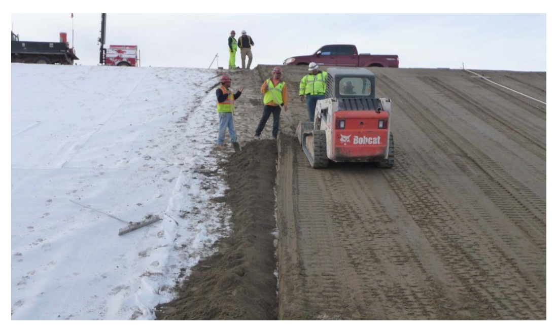
Figure 17.6.5-1. Trimmed vertical construction joint at Warren H. Brock Reservoir, California.

Construction joints may occur in both transverse and longitudinal directions at stoppages of work. However, specific locations of these joints do not need to be specified. The joint should be trimmed to form a straight vertical joint. Figure 17.6.5-1 shows trimming of the construction joint at Warren H. Brock Reservoir. Prior to placement of the next lift, any loose material should be removed to provide a clean surface, the surface should be moistened, and bonding treatment should be applied as discussed in Section 17.6.4, "Curing and Bonding." When constructing stairstep placements, successive lifts should not have their construction joints at the same location because this would create the potential for a continuous vertical joint.