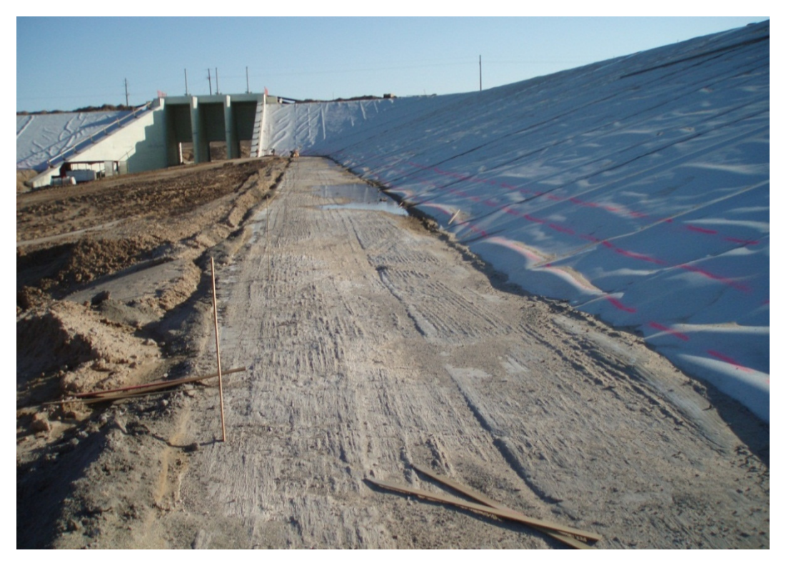
Figure 17.5.7-2. Scarified soil-cement lift at Warren H. Brock Reservoir, California.

The bonding between lifts is improved by scarifying the soil-cement surface upon which the next lift is to be placed. A power-driven broom can be used to scarify the surface to a depth of 1/8 to 1/4 inch. Figure 17.5.7-2 shows the scarified soil-cement lift at Warren H. Brock Reservoir. Loose material and accumulated debris should be removed immediately prior to placement of the next lift. Figure 17.5.7-3 shows the equipment used to scarify and clean the soil-cement lift at Warren H. Brock Reservoir. Scarification is particularly critical at the end of each day's work, or whenever construction operations are interrupted for more than 1 hour.