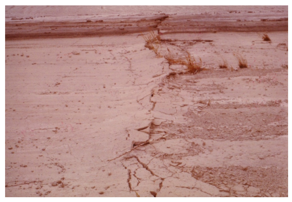
Figure 17.5.5-3. Damaged soil-cement slope protection on the 10H:1V beaching slope at Merritt Dam, Nebraska.