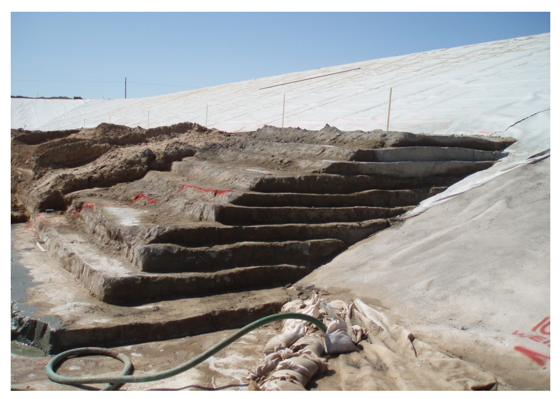
Figure 17.5.5-1. Stairstep soil-cement placement at Warren H. Brock Reservoir, California.