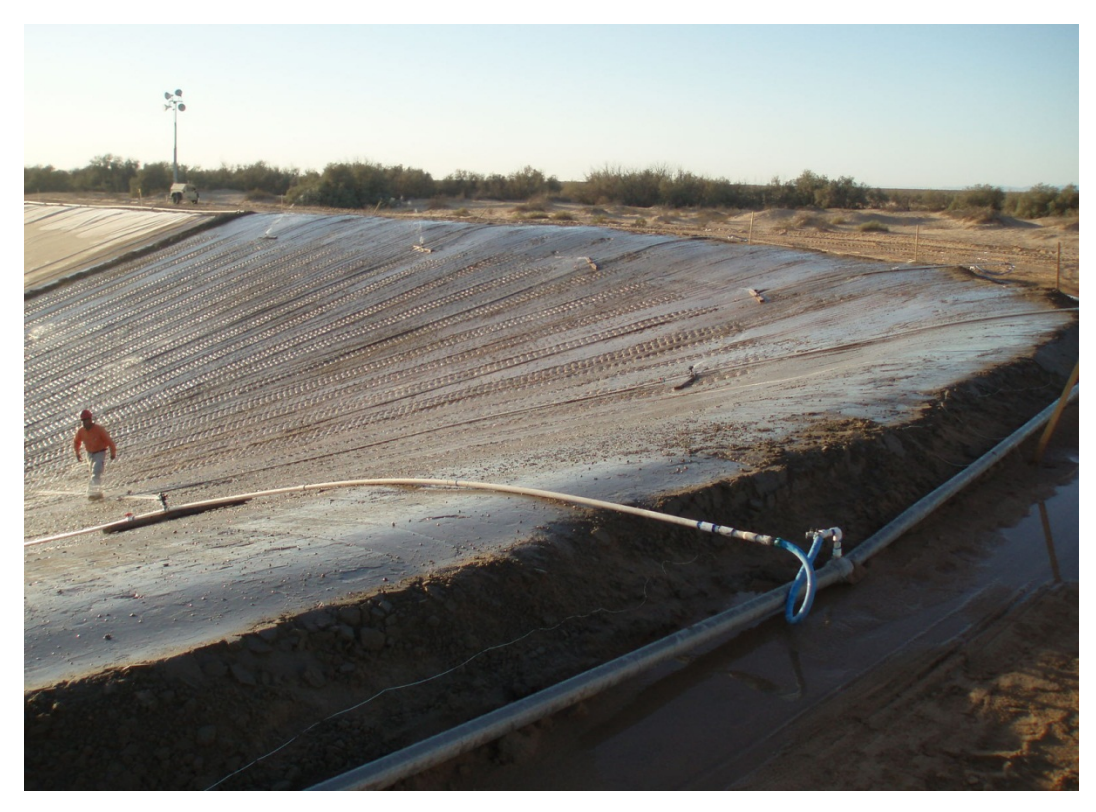
Figure 17.6.4-1. Sprinklers used for water cure at Warren H. Brock Reservoir, California.

have an opportunity to bond. Cleaning the bonding surface is accomplished by using a power-driven steel broom to remove all loose and uncemented material. Unless an overlying soil-cement lift is to be placed within 1 hour, the contractor should not be permitted to broom sooner than 1 hour after compaction because the broom tends to remove excessive amounts of the lift surface that have not hardened sufficiently. This results in unnecessary waste and increases cement cost. In the past, this brooming has also been used to striate the lift surface with the intent of improving the (mechanical) bond between lifts. As mentioned earlier, coring, test sections, and studies have suggested that brooming alone does not appear to contribute significantly to improved bonding.