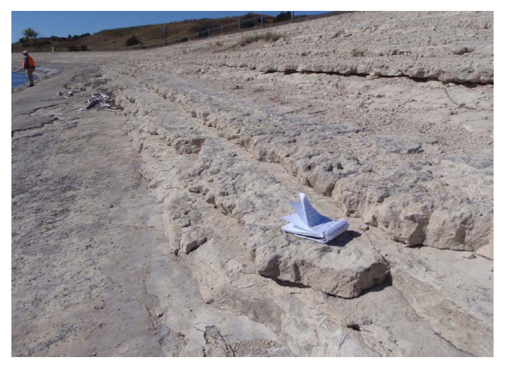
Figure 17.2.2-5. Typical condition of upstream slope protection at Merritt Dam, Nebraska.