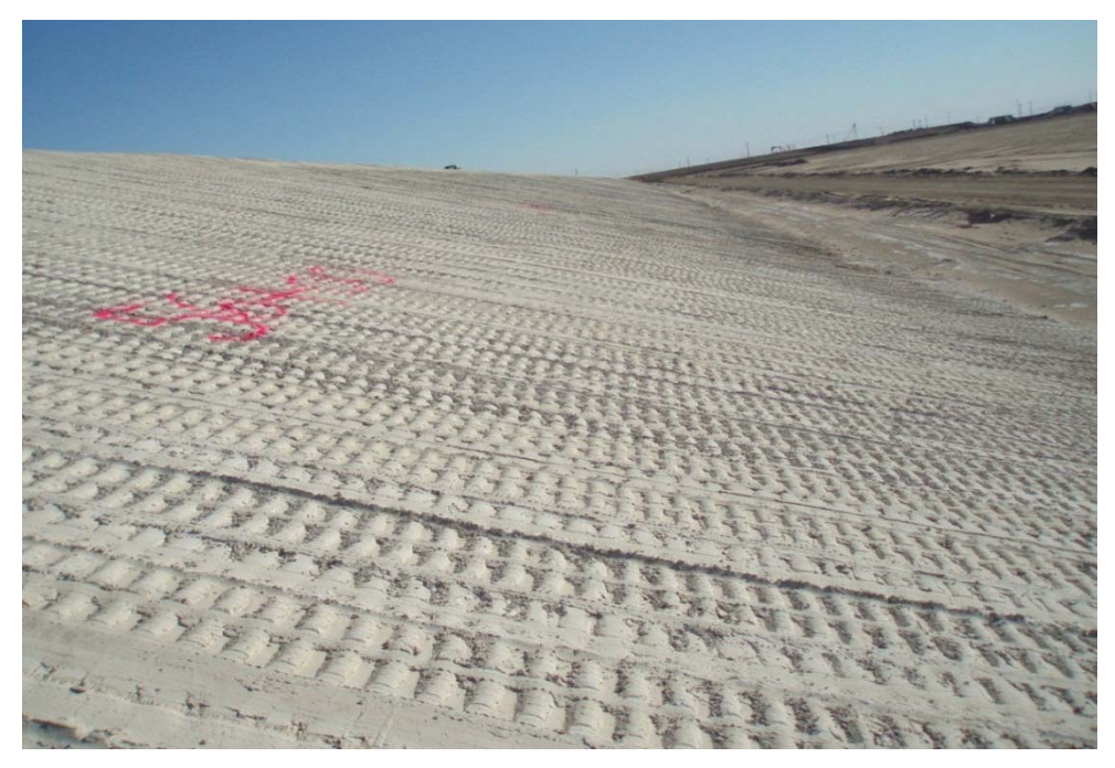
Figure 17.5.3-3 Plating soil-cement at Warren H. Brock Reservoir, California.

however, the flatter slopes required for placement provide little resistance to wave runup and more freeboard may be necessary. Figure 17.5.3-3 shows the completed plating soil-cement placement at Warren H. Brock Reservoir in California.