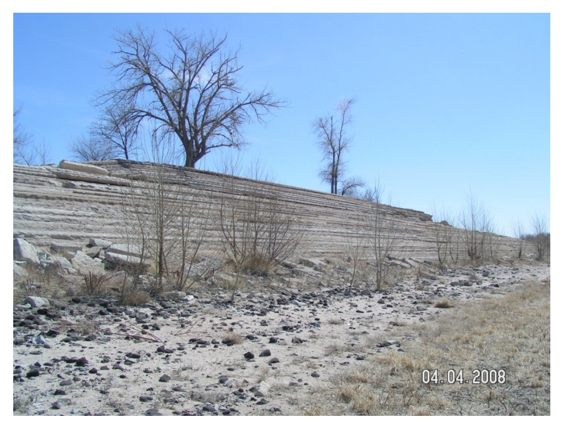
Figure 17.2.2-1. Soil-cement test section at Bonny Reservoir, Colorado.

The performance of the Bonny Reservoir test section was observed for 10 years. During that time, the test section experienced an average of over 100 freeze/thaw cycles a year and wind-induced waves that reportedly exceeded 8 feet in height. Due to the lack of a locally available riprap source and the favorable performance of the Bonny Reservoir test section, soil-cement was selected for upstream slope protection at Merritt Dam (completed in 1963). Since about 1960, soil-cement slope protection has been constructed on several Reclamation dams and many other non-Reclamation (public and private) dams that were designed and constructed by others.