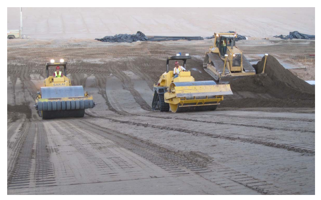
Figure 17.6.3-1. Plating soil-cement placement at Warren H. Brock Reservoir, California.

On early Reclamation stairstep soil-cement projects, the lifts were usually compacted by six passes of a sheepsfoot roller, followed by four passes of a pneumatic roller. Figure 17.6.3-2 shows the compaction of 6-inch, soil-cement lifts using sheepsfoot and pneumatic rollers at Starvation Dam in Utah. Vibratory compaction, using vibratory steel drum rollers, has also been used to compact soil-cement. Use of pneumatic-tired rollers or steel drum rollers is now the most common equipment used to compact soil-cement in stairstep applications. Figure 17.6.3-3 shows the use of a vibratory steel drum roller compacting 9-inch, soil-cement lifts at Warren H. Brock Reservoir in California.