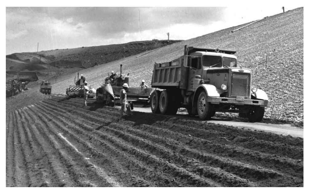
Figure 17.6.3-2. Placement of soil-cement slope protection, Starvation Dam, Utah.

the soil-cement be uniformly compacted to a minimum density of 97 percent and an average density of 98 percent of the laboratory maximum dry density. On any soil-cement job, construction control testing is required to verify that adequate density is achieved throughout the entire lift.