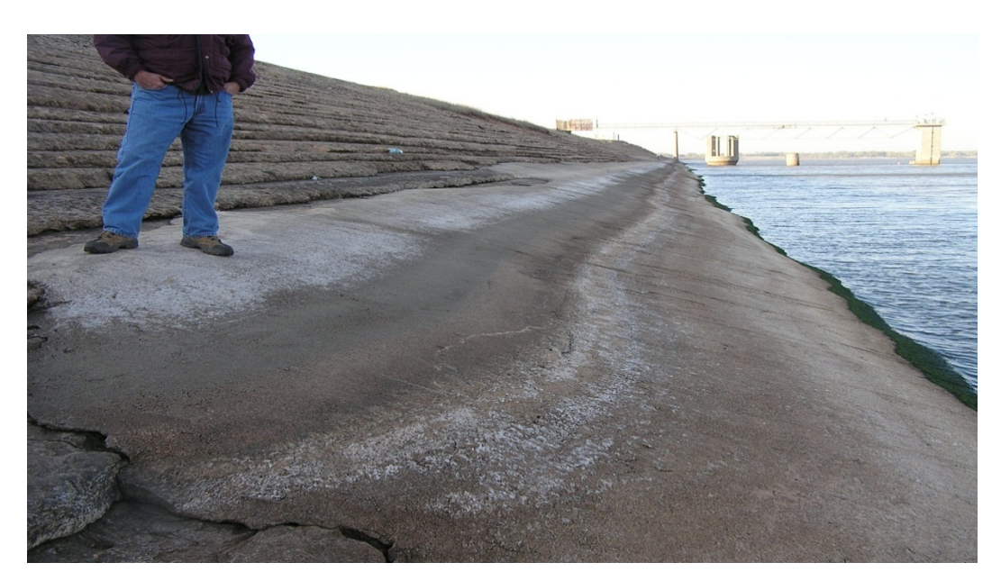
Figure 17.2.2-4. Closeup view of concrete patch on soil-cement slope protection at Cheney Dam, Kansas.

Due to ice loading and wave action, deterioration of the upstream soil-cement slope protection at Merritt Dam in Nebraska has required ongoing maintenance by the irrigation district [5]. The soil-cement slope protection has been repaired (or patched) several times over the years. Deterioration is most severe in the area of the winter reservoir water surface elevations. Figures 17.2.2-5 and 17.2.2-6 show the condition of the soil-cement slope protection observed during the 2008 CFR examination. Figure 17.2.2-5 shows a portion of the concrete repairs. The stairstep method of placement was used on the 4H:1V upstream slope to place 6-inch-thick (compacted thickness) lifts. The horizontal width of the compacted soil-cement layer was 8 to 10 feet. As long as the soil-cement slope protection continue to perform its intended function.