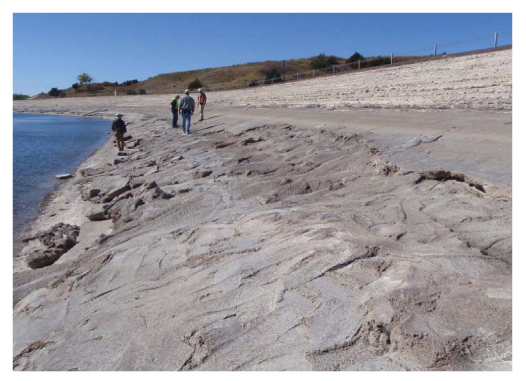
Figure 17.2.2-6. Portion of concrete repairs to soil-cement slope protection at Merritt Dam, Nebraska.