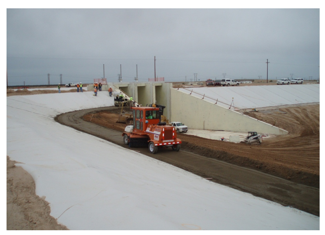
Figure 17.5.7-3. Cleaning soil-cement lift at Warren H. Brock Reservoir, California.