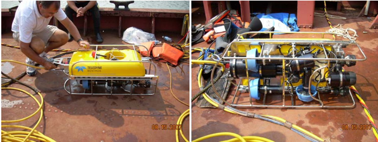
Figure 3. Teledyne-Benthos Stingray shown from above (left) and underneath (right) with longitudinal thrusters at left end, lateral thruster and electronics housing in middle, and tilt bar with camera, lights, and sonar attached at right end.

Sprite scanning sonar mounted on top. The other had a BlueView P900E-20 imaging sonar mounted underneath. The ROVs with accessories weigh