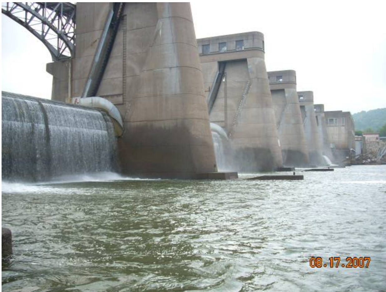
Figure A8. View when moored in stilling basin below dam, with gate 2 at left of picture.