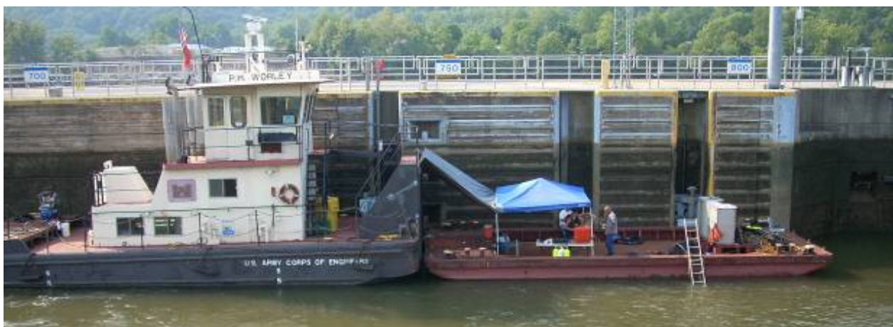
Figure A5. Barge and towboat moored at downstream end of 800-ft main lock chamber before inspection of lower miter gates.