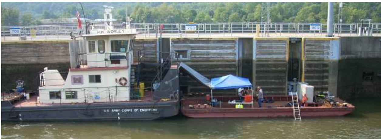
Figure 8. Dive-team barge and towboat moored at downstream end of 800-ft main lock chamber before inspection of lower miter gates.