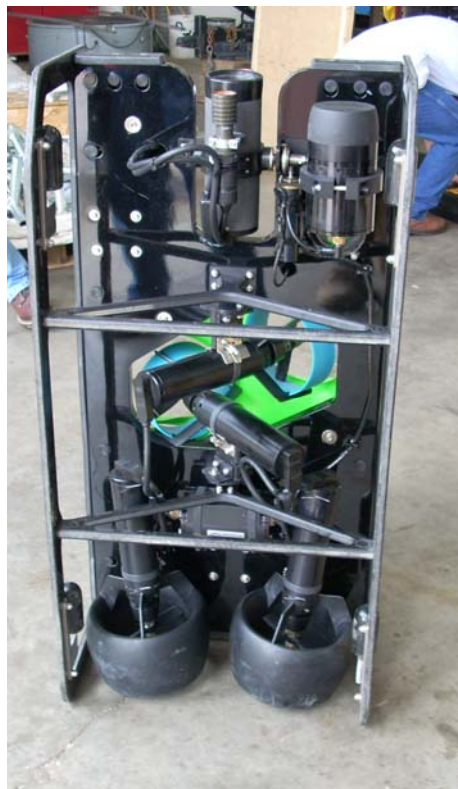
Figure 1. Deep Ocean Engineering Triggerfish ROV carried by two divers (top). Underside (bottom) shows longitudinal thrusters at bottom, diagonal thrusters in middle, tilting video camera and light in top-center slot, and BlueView imaging sonar in top-right corner.