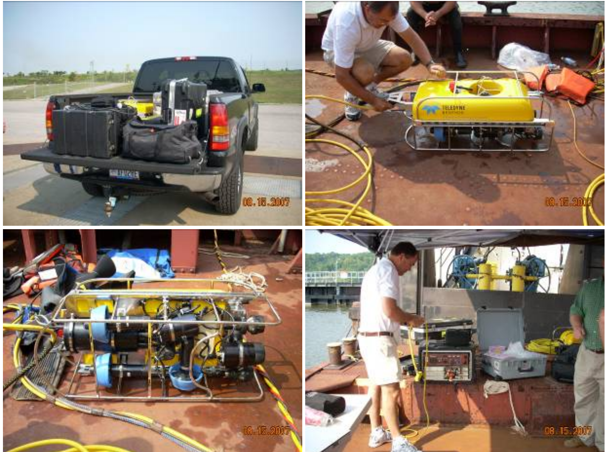
Figure A4. Teledyne-Benthos system showing (clockwise from top left): system components fill pick-up truck; Stingray ROV with stainless steel frame and thruster impellers; assembly of topside control and display equipment; underside of ROV with longitudinal thrusters at left end, lateral thruster and electronics housing in middle, and tilt bar with camera, lights, and sonar attached at right end.