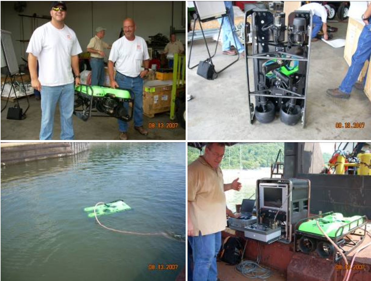
Figure A1. Deep Ocean Engineering system showing (clockwise from upper left): Triggerfish ROV carried by two divers; underside of ROV with longitudinal thrusters at bottom, diagonal thrusters in middle, tilting video camera and light in top-center slot, and BlueView sonar in top-right corner; ROV and topside control/display equipment; ROV and tether in water just upstream of auxiliary lock.