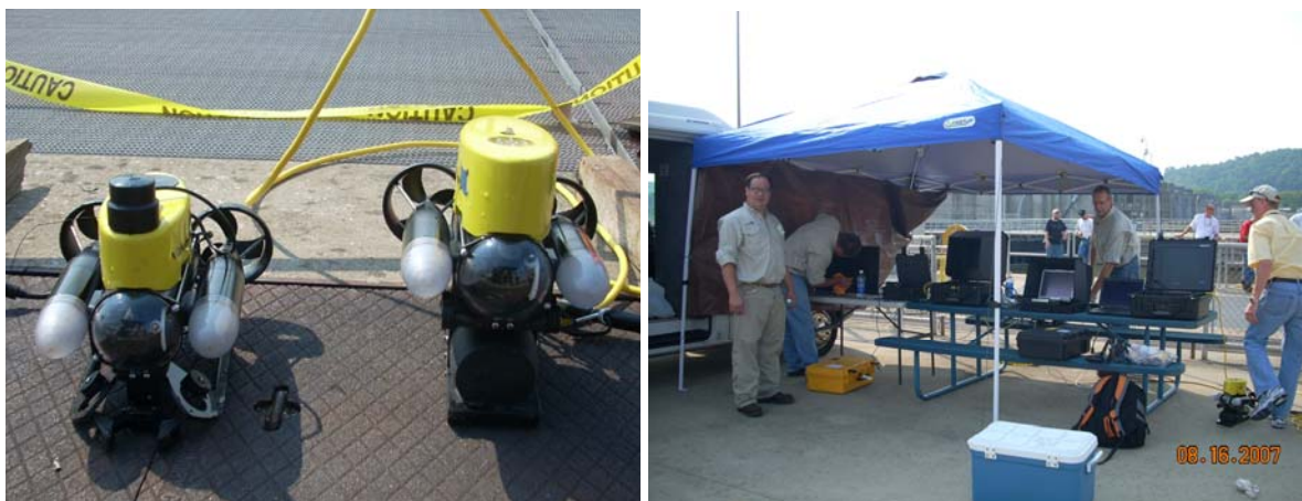
Figure 4. VideoRay's two Pro 3 XE GTO vehicles with scanning sonar (left vehicle) and imaging sonar (right vehicle) and topside control and display equipment for both ROVs.

about 5–6 kg and measure about 0.36 \times 0.21 \times 0.33 m. These were the smallest and lightest ROVs demonstrated. They each have a fixed-focal-length tilting color video camera facing forward, fixed front lights, and a low-light black and white video camera facing rearward. Each ROV uses two horizontal thrusters for fore/aft propulsion and a smaller vertical thruster; they are rated at 152-m depth. Navigation aids include a compass and a depth sensor. The compact topside systems each integrate an operator control unit with joystick to drive the vehicle, auto-depth function, and a video display with data overlay. The tethers were 0.8–1.0 cm in diameter. The cost for each Pro 3 XE GTO system was about $27,500 exclusive of sonar and gripper.