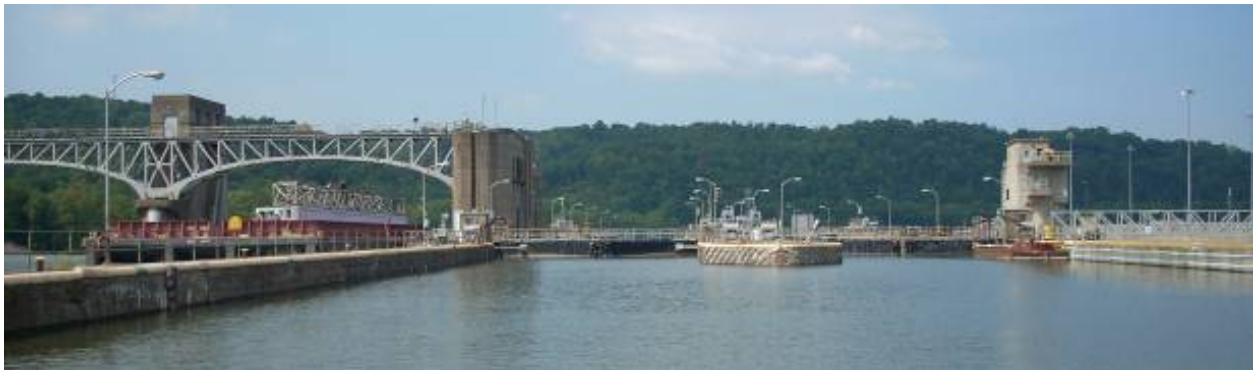
Figure A2. Winfield Locks and Dam twin auxiliary locks (center of photo) are located between the new main lock chamber (right) and dam gates (left). ROV deployments were just upstream of left auxiliary lock to inspect miter-gate seals and filling-culvert ports.