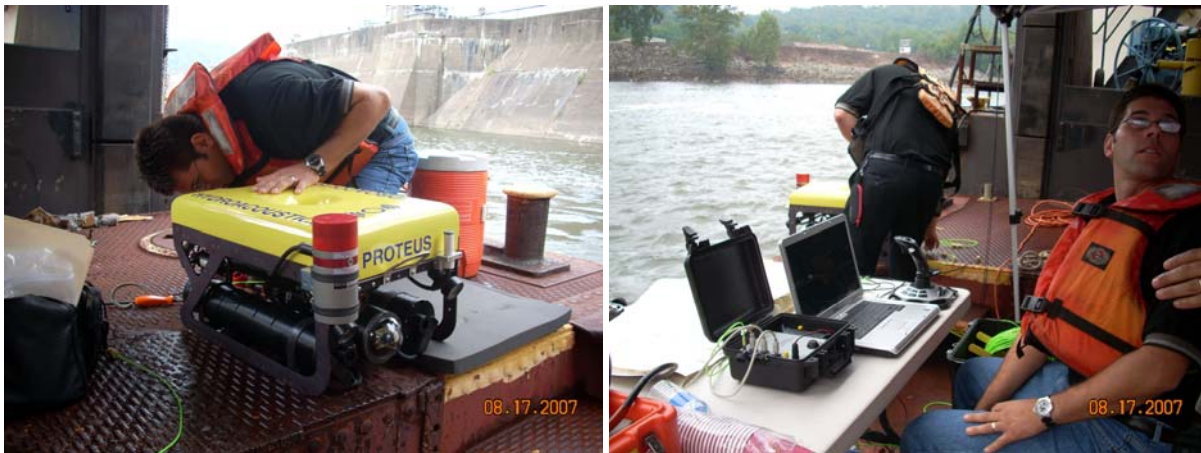
Figure 5. Hydroacoustics Proteus 500 ROV (left) with vertically mounted Imagenex sonar, tilt color camera, fixed lights, and two longitudinal battery tubes along bottom of vehicle, and (right) laptop-based operator station.

Figure 5 shows the Hydroacoustics Proteus 500 system. This ROV was powered by on-board batteries (normally Li-Ion but NiMH at the demo) rather than powered via the tether as all other systems demonstrated. Mounted at the front, the vehicle has two fixed-focal-length color video cameras (one tilting, one fixed) and two fixed lights. It also has a vertically mounted Imagenex 881A scanning sonar. With sonar, the ROV weighs about 43 kg and measures about 0.69 \times 0.46 \times 0.45 m. The ROV uses two longitudinal thrusters for fore/aft propulsion, one thruster for vertical propulsion, and one thruster for lateral propulsion. Its depth rating is 152 m. Navigation aids include a compass and depth sensor. The topside equipment includes a laptop computer-based operator control unit with joystick to drive the vehicle, and auto-depth and auto-heading functions. The laptop screen can display video and sonar simultaneously in separate windows. The tether was the smallest demonstrated at 0.35 cm in diameter. It is slightly negatively buoyant but floats can be added to provide slight positive buoyancy. The system cost as tested was about $25,000 exclusive of the sonar.