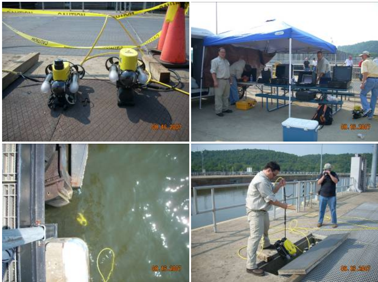
Figure A6. VideoRay systems showing (clockwise from upper left): two Pro 3 XE GTO vehicles with scanning sonar (left vehicle) and imaging sonar (right vehicle); topside control and display equipment for both ROVs; the ROV with imaging sonar being lowered into the land-side filling valve chamber to inspect the grease lines and valve seals; looking down on ROV with scanning sonar approaching the miter gate to inspect the quoin block, sills, and J-seals.