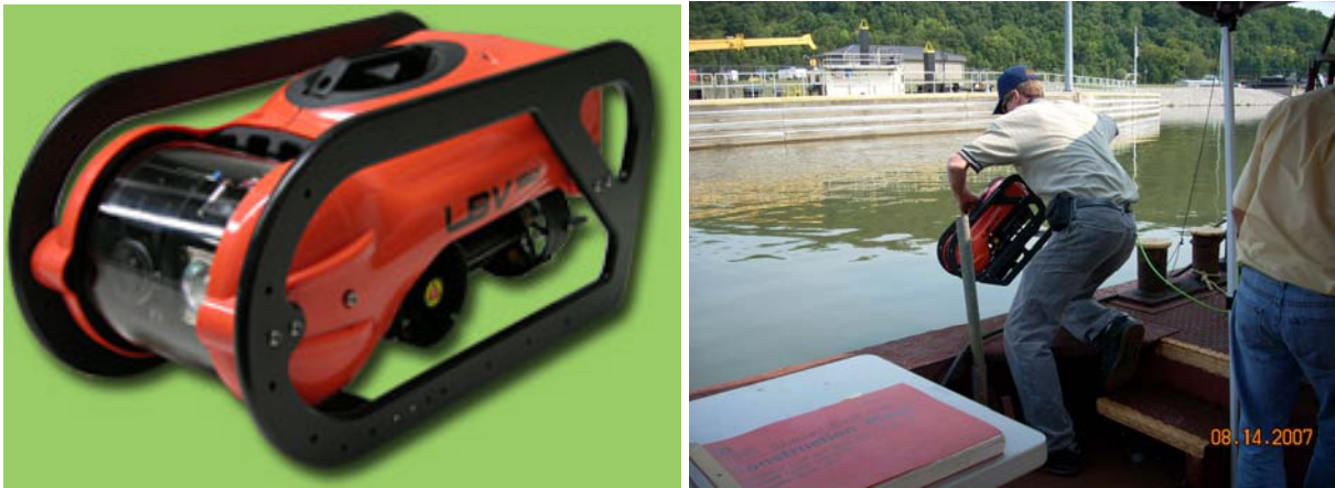
Figure 2. SeaBotix LBV150SE ROV (left) with color camera, black and white camera, and light mounted on tilt frame behind front cylindrical window, and one-person deployment/recovery (right).

vehicle. The ROV uses two longitudinal thrusters for fore/aft propulsion, one thruster for vertical propulsion, and one thruster for lateral propulsion. Its depth rating is 150 m. Navigation aids include a fluxgate magnetic compass and a depth sensor. The compact topside system integrates an operator control unit with joystick to drive the vehicle, auto-depth and auto-heading functions, and a video display with data overlay. The tether is 0.76 cm in diameter. The system cost as tested was about $26,300 exclusive of the sonar.