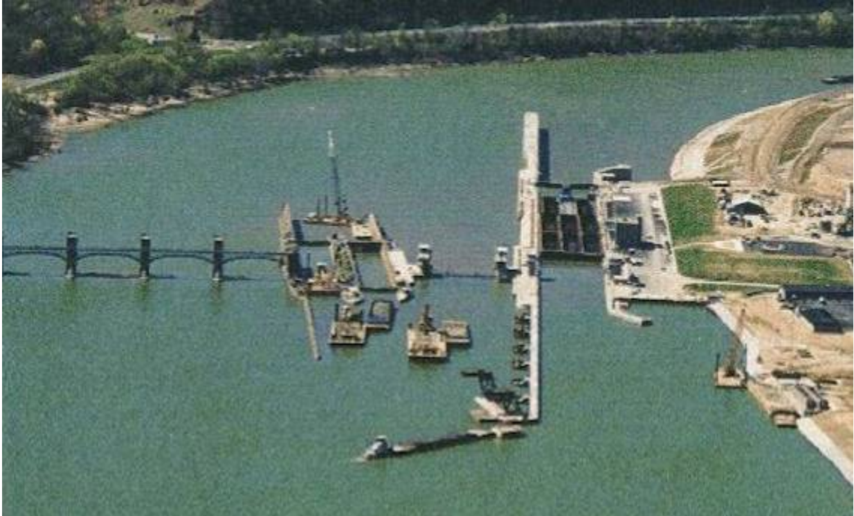
Figure 7. Winfield Locks and Dam on the Kanawha River, WV looking downstream. In this photo, the main lock chamber (center right) is filled with eight barges and a towboat. The older auxiliary locks in the center can accept individual barges. Four bays of the dam are visible across the center left.

within Mobile District and occasionally for other Districts (Lever et al. 2007). We pressed Byars into service as a guest ROV pilot to help us understand how well the systems could conduct the underwater inspections once the pilot gained experience.